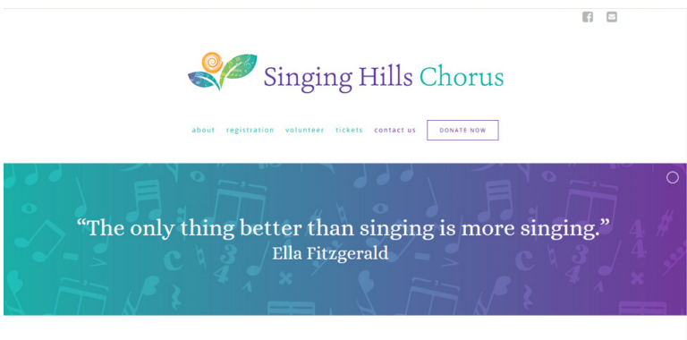
Singing Hills Chorus https://singinghillschorus.org/